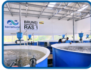
Recirculating Aquaculture Systems (RAS)