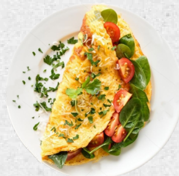
PESTO SPANISH OMELETTE

Loaf Slice-Cream Cheese-Pesto-omelette-Mushroom-mixed leaves-cherry tomato