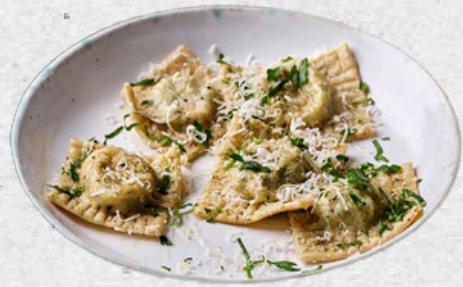
RAVIOLI SPINACH & RICOTTA 300 EGP