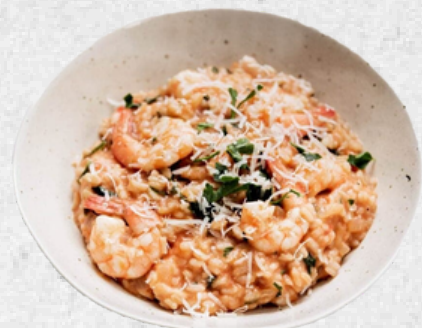
SHRIMP RISOTTO 280 EGP