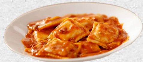
RAVIOLI BOLOGNESE 350 EGP