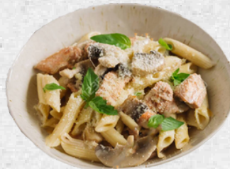
PENNE ALFREDO 300 EGP