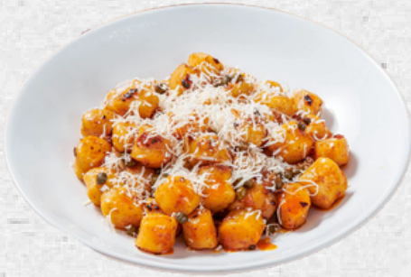
GNOCCHI 300 EGP