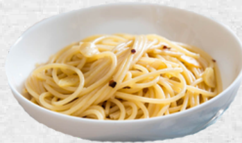
SPAGHETTI AGLIO OLIO 180 EGP