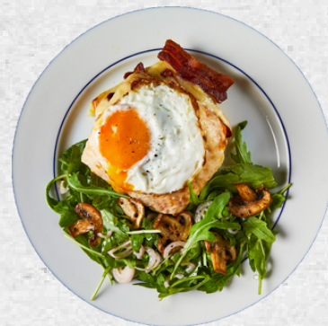
BACON CROQUE MADAME

Loaf Slice, 2eggs, Bacon, beshamel sauce,cheese, mixed leaves, cherry tomato.