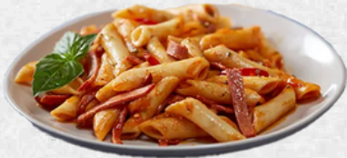
PENNE ARRABBIATA 200 EGP