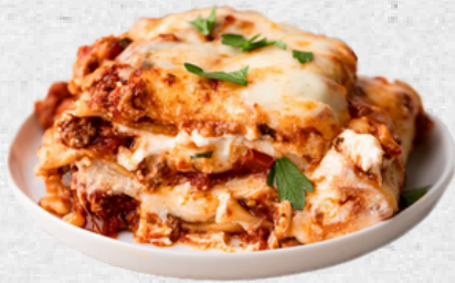
LASAGNA 300 EGP