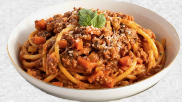
SPAGHETTI BOLOGNESE 300 EGP