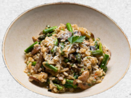
MUSHROOM RISOTTO 250 EGP