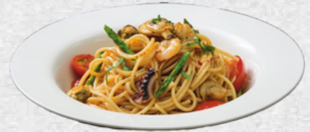
SPAGHETTI SEAFOOD 400 EGP