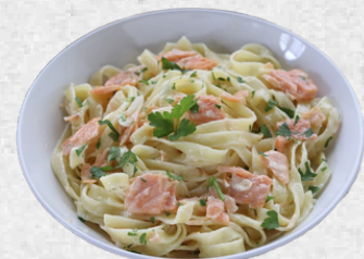
FETTUCCINE SALMON 400 EGP