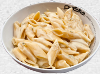
PENNE FOUR CHEESE 250 EGP