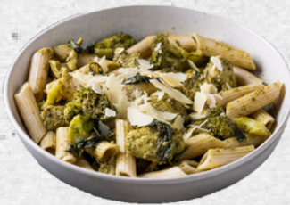
FUSILLI PESTO 250 EGP