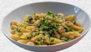
PENNE SHRIMPS & ZUCCHINI 350 EGP